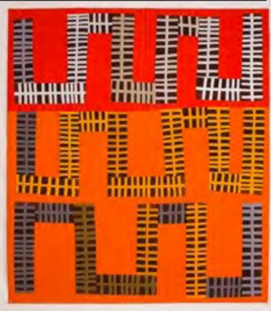
RIFF #6: Detour 2016© Nancy Crow

Close-up they revealed astonishing visual information via technique whether done by hand or sewing machine. However, over the past four decades, quilts have diminished in size and taken on a completely different aura. Some of this can be blamed on artists not wanting to work large, not wanting to take on the physical endurance needed for creating large works. And some of this can be clearly blamed on galleries and an assortment of art competitions stating they have space only for medium to small works maybe because they want to exhibit a greater number of works or because they want to sell smaller works!