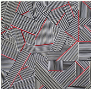
Hope Wilmarth Fault Line COLLECTION A