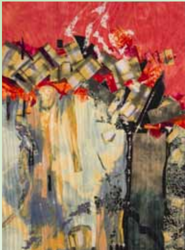
Randy Frost Rocky Trail COLLECTION B

Each biennium, the 80+ piece Quilt National '15 exhibition is divided into three touring collections. The purpose of dividing the exhibition into smaller groups is to provide smaller venues the opportunity to display the Quilt National works. The three collections may be rented individually or in combination for one week or a group of weeks as available. The following is a listing of the artists and works assigned to the three Quilt National '15 Collections.