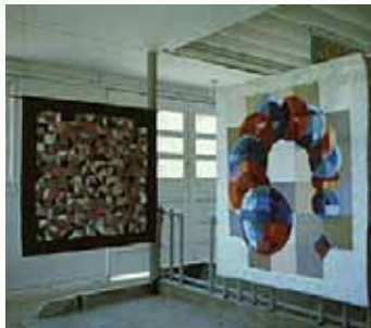
An early Dairy Barn interior; by its size and the breadth of its representation, Quilt National '79 immediately assumed the status of a milestone in the history of American art quilting.