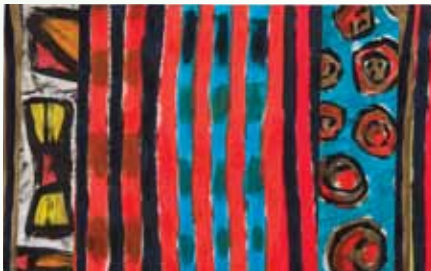
Astrid Hilger Bennett Summerbeach 2 COLLECTION C