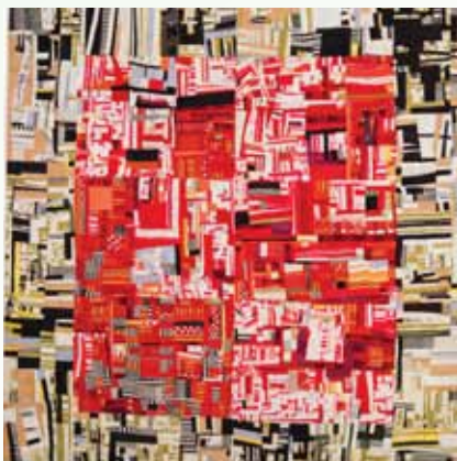
Yasuko Saito Movement #71 COLLECTION B