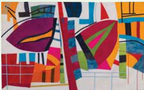
Daren Redman Glorious Summer COLLECTION A