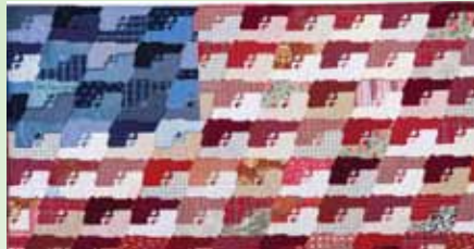
Kristin La Flamme 'Murica COLLECTION C