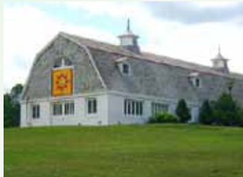
The Dairy Barn Arts Center