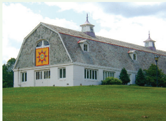
The Dairy Barn Arts Center