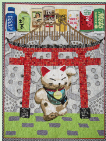
Robin Schwalb Jive Boss Sweat COLLECTION A