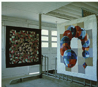
An early Dairy Barn interior; by its size and the breadth of its representation, Quilt National '79 immediately assumed the status of a milestone in the history of American art quilting.