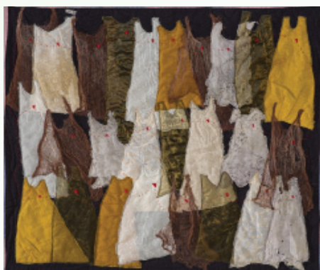
Lorie McCown My Grandmother's Dresses COLLECTION A