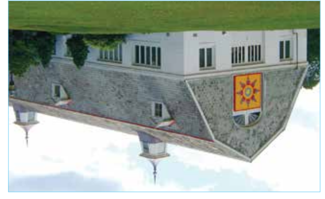
gallery that features national and international artists working in National Registry of Historic places is a dynamic, contemporary art The Dairy Barn Arts Center, a 101-year-old barn, listed on the