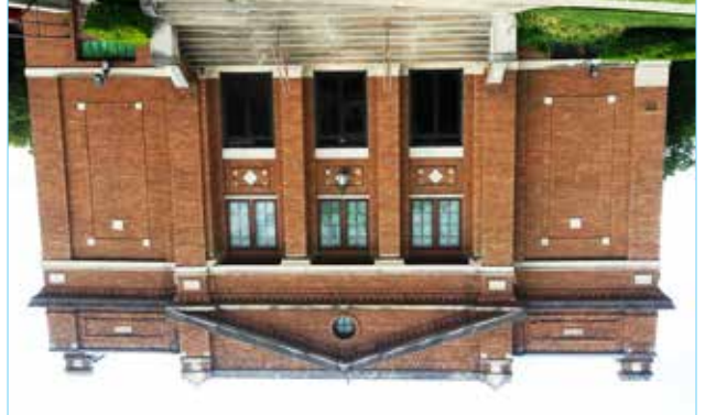
and natural heritage, and inspires communities to make our region History Center preserves and shares our region's unique cultural Located in a 100-year-old church building, the Southeast Ohio

Quilt National The Best of Contemporary Quilts