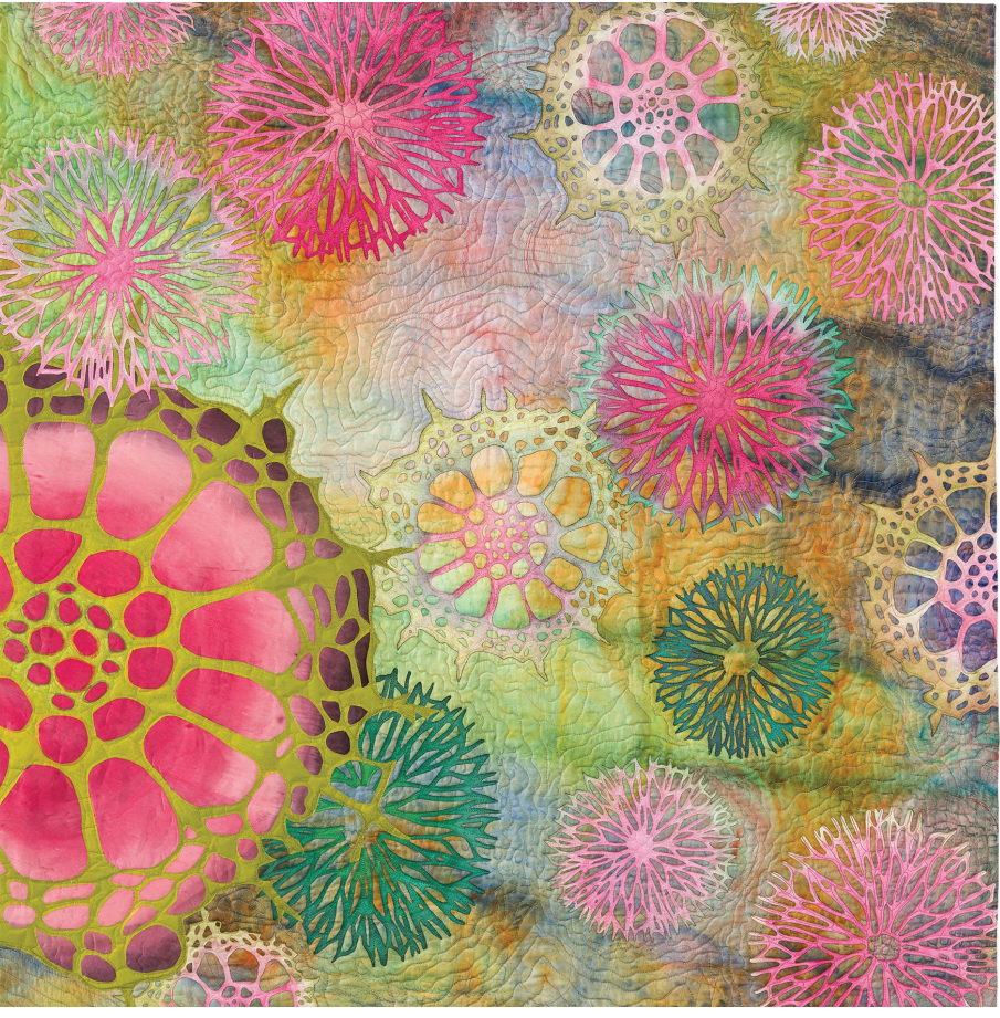
Sandy Gregg, Blossom Burst

are October 2023 through September 2025.