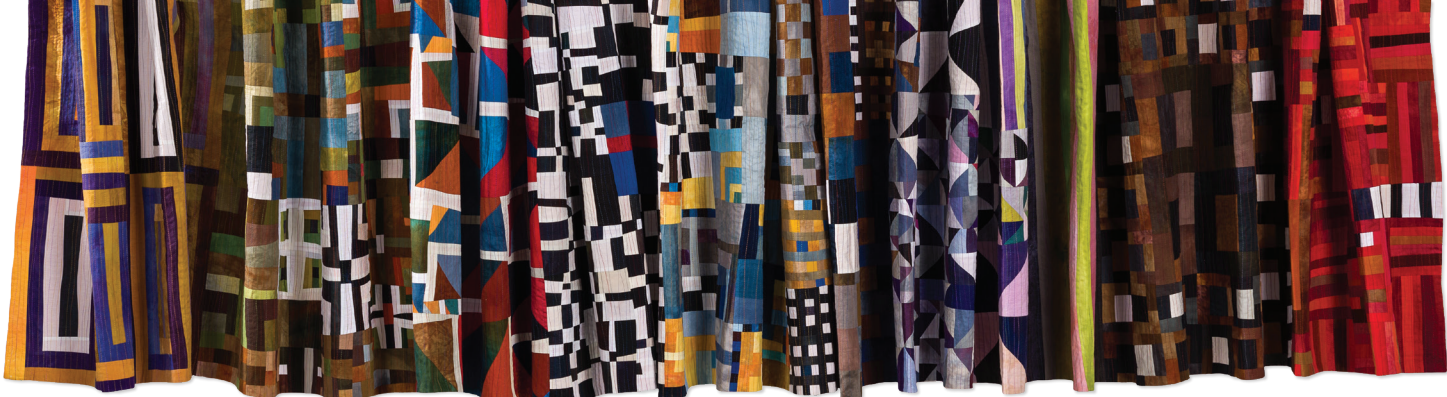
Gabrielle Paquin, Fossil